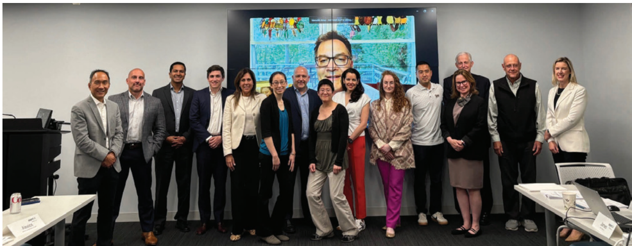
*Pictured here are dedicated volunteer members of the Quality & Research related committees at their in-person meeting in May at Academy headquarters in Rosemont, IL. The committees will continue their efforts to advocate for and develop high-quality standards of care for PM&R to enhance patient outcomes.