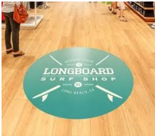
Sample of a floor decal