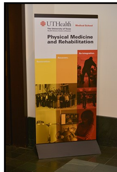
Sample of a meter board.

For more information on sponsorship and advertising opportunities, contact Sara Rossi Statis at (847) 737-6038 or srossistatis@aapmr.org .